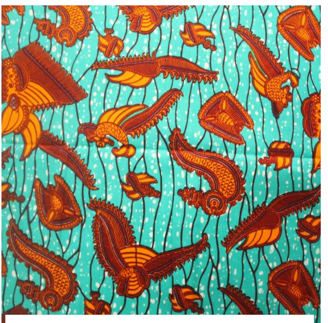
) bra retwa wo dε sradaa

Cultural & Symbolic Interpretation: the Ghanaian believes that to live a successful