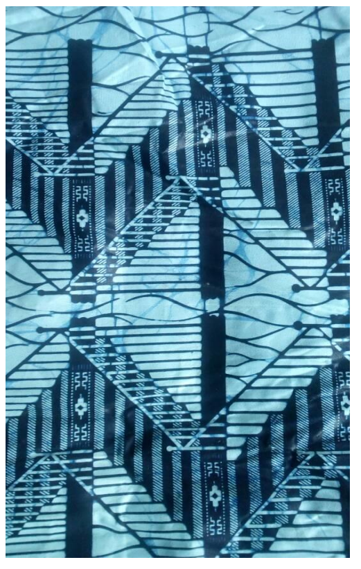
Owu atwer baako nfo

Cultural & Symbolic Interpretation: Death in the Ghanaian culture is the last stage of the rites of passage. It is a transition from the earth to another world. The adage explains death as a universal phenomenon. It is inevitable, each and everyone on this earth will one day die and therefore lead an exemplary life before the last breath ceases. It sends signal of good deeds to the society.