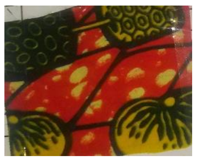
Ahwendzepa tsew w3 mpanyinfo enyim

The motif is made up of beads threaded with a string. It is repeated systematically to create a pattern. It also has some floral patterns and lines as textures in the fabric.