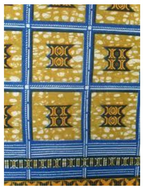
\mathcal{E}b\varepsilon ka me ho as \varepsilon m a fa egua na

The fabric design is a provocative and rival wear which sends signals to perceived enemies.