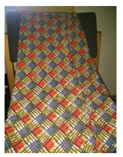
Enyiwa ber a onnso gya

Cultural & Symbolic Interpretation: this design depicts patience, self control, self discipline and self containment. It also means that it is not every frowned face that depict anger.