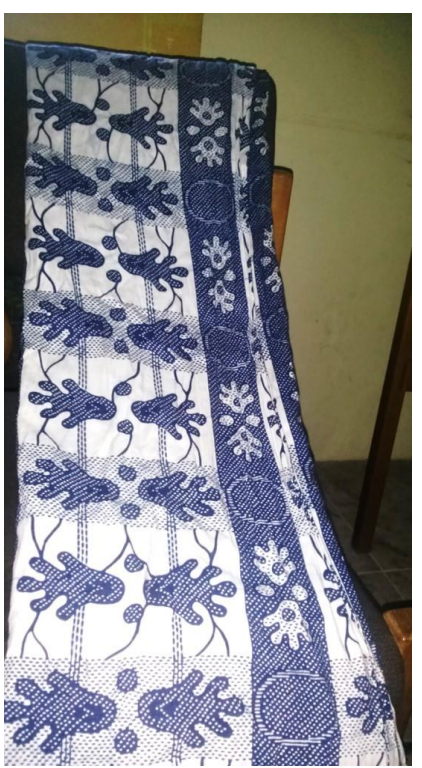
Se wo nsa ekyir beye wo dew a, Intse de wo nsa mu

The motif involves two palms lying opposite to each other and two circles placed in between them, one at the right side and the other at the left side. There are series of small dot displayed in the palms. The palm is in the form of silhouette with series of dot displayed in it.