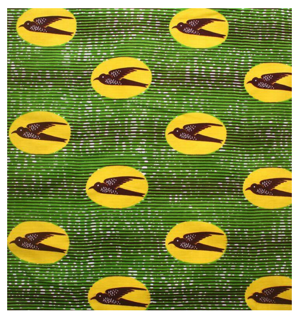
Sika tu dɛ anomma

Cultural & Symbolic Interpretation: it symbolizes money. If money is not handled properly will be lost. Bad or wrong investment decisions will cause one to loose money.