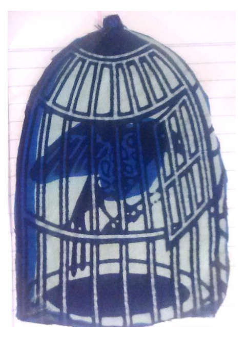
Obatan na 5nim dza ne mba bedzi

ENNYI SIKA A ENTOW 'BLOCK' (IF YOU DO NOT HAVE MONEY, DO NOT LAY BLOCKS)